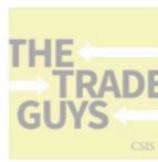
The Trade Guys CSIS | Center for Str...