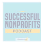
Successful Nonprofits Podcast The Goldenburg Gro...